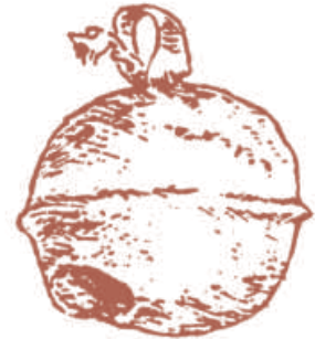
Brass bell from Parkin site

All researchers agree, however, that the Spanish army reached the Mississippi River in the spring of 1541, two years after landing in Florida. The chronicles indicate that after building rafts, the expedition crossed over into what is now Arkansas on June 18, 1541.