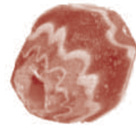
Chevron bead from Parkin site

Rock and Pine Bluff. After Hernando de Soto's death at Guachoya in southeast Arkansas on May 21, 1542, command of the expedition fell to his lieutenant, Luis de Moscoso. The survivors decided to abandon the search for riches and to march overland to Mexico. Traveling through southwest Arkansas and into Texas, they found less and less food and water, and fewer people. Eventually, they turned back, retracing their route to southeast Arkansas. They spent the winter of 1542-1543 at the settlement of Aminoya, which may have been located north of the confluence of the White and Arkansas Rivers. There they built boats, and in 1543 they set sail down the Mississippi River to the Gulf and eventually to Mexico. They were attacked almost continually while traveling on the Mississippi River. Four years after landing in Florida, the first major European expedition into the interior South had failed.