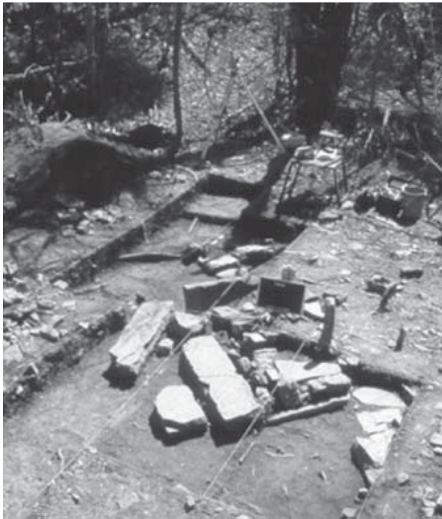
Feature 9 foundation showing fireplace remains

Our first question sprang from the archeological evidence: We unearthed the stone foundation of a house with fireplaces at both ends. We wanted to learn "Who lived here?"