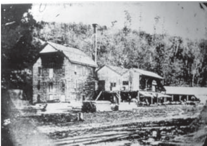
Van Winkle's Mill ca. 1880.