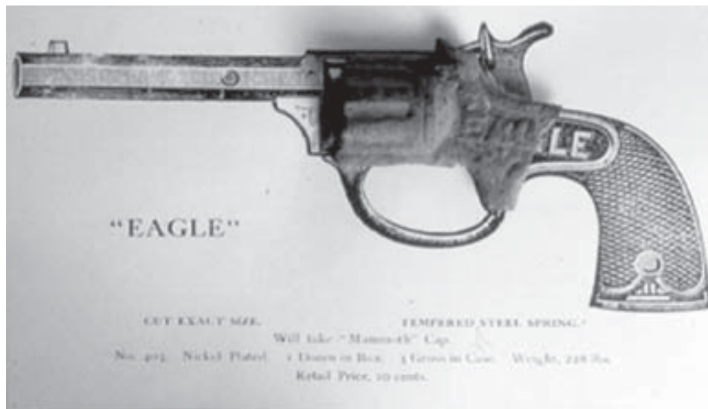
Toy gun fragment and an 1895 advertisement.

The mill was in operation for a long time, both before and after the Civil War. When was the house occupied? The manufacture dates of the artifacts we found mainly fell between 1870 and 1900. (We could tell this based on information from factory records and manufacturer's advertising.) This date range was confirmed by the manufacture dates of building hardware, including nails and window glass.