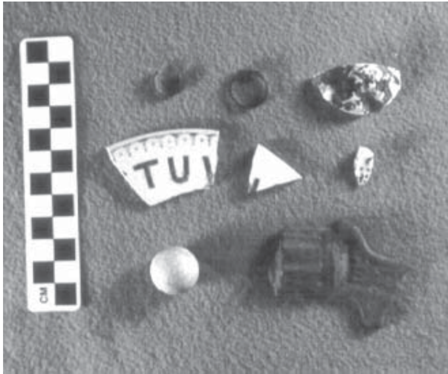
Feature 9 artifacts including child's rings, doll fragment (upper left), a child's alphabet plate (center), a marble, and a toy gun fragment (lower right).

The mill was in operation for a long time, both before and after the Civil War. When was the house occupied? The manufacture dates of the artifacts we found mainly fell between 1870 and 1900. (We could tell this based on information from factory records and manufacturer's advertising.) This date range was confirmed by the manufacture dates of building hardware, including nails and window glass.